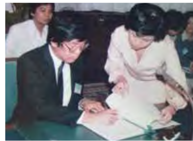
Dr. Jaime C. Laya Governor, Central Bank of the Philippines