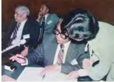
Drs. Rachmat Salleh Governor, Bank Indonesia